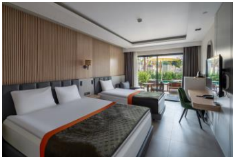
Deluxe Swim Up Room 37 m 2