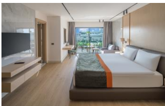
Executive Private Pool Suite 2 Bedrooms 175 m 2

In the area where the Deluxe Swim Up rooms are located, there is a separate 160 m 2 shared pool in addition to the main pool. On the shared pool terrace, each room has two sun loungers, one umbrella, two chairs, and one table.