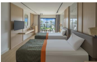
Executive Private Pool Suite 3 Bedrooms 190 m 2

Adjustable central air conditioning, minibar, tea and coffee set, telephone in the room and bathroom, luggage space, wireless internet, makeup mirror, USB charging unit, digital safe, hair dryer, premium bathroom amenities, bathrobe, and slippers.