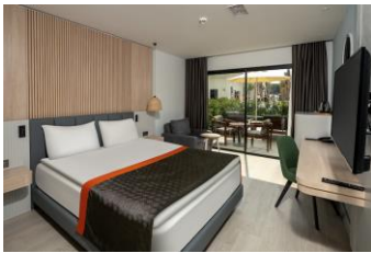
Deluxe Swim Up Family Room 63 m 2

In the area where the Deluxe Swim Up rooms are located, there is a separate 160 m 2 shared pool in addition to the main pool. On the shared pool terrace, each room has two sun loungers, one umbrella, two chairs, and one table.