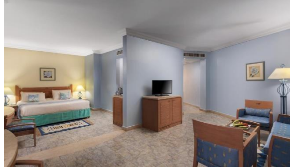
58 sq. with pool view (balcony or terrace), king bed, living area