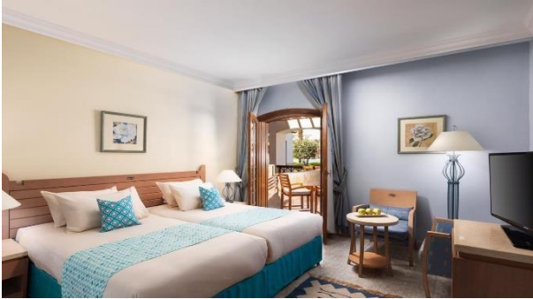
36 sq. with pool and garden view (balcony or terrace), king or twin bed