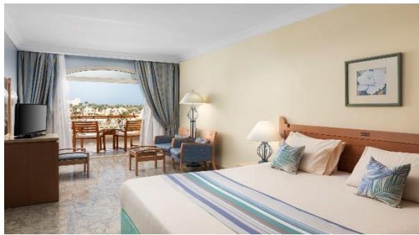
38 sq. with pool view (balcony or terrace), king or twin bed