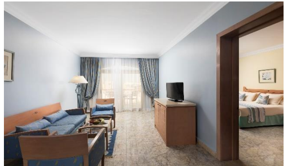
70 sq. with pool view (balcony or terrace), king bed, one bedroom, one living room; 2 bathroom

Each room including: safe box, phone, TV with English, Polish, Arabic, Russian channels, empty mini bar, 1 small bottle of water per each adult guest every day, air condition, kettle, 1 or 2 extra bed.