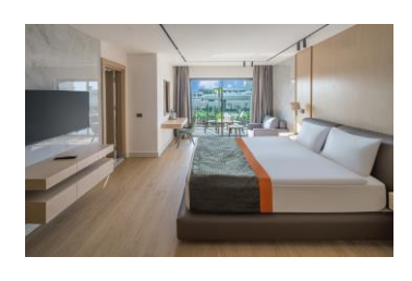
Executive Private Pool Suite 2 Bedrooms 175 m<sup>2</sup>

In the area where the Deluxe Swim Up rooms are located, there is a separate 160\,\mathrm{m}^2 shared pool in addition to the main pool. On the shared pool terrace, each room has two sun loungers, one umbrella, two chairs, and one table.