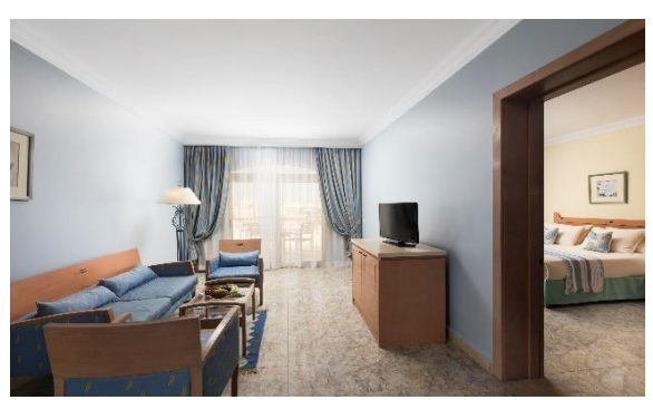
70 sq. with pool view (balcony or terrace), king bed, one bedroom, one living room; 2 bathroom

Each room including: safe box, phone, TV with English, Polish, Arabic, Russian channels, empty mini bar, 1 small bottle of water per each adult guest every day, air condition, kettle, 1 or 2 extra bed.