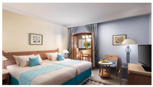
36 sq. with pool and garden view (balcony or terrace), king or twin bed