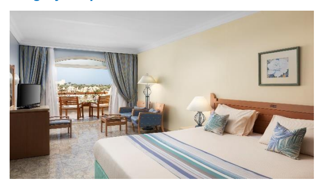
38 sq. with pool view (balcony or terrace), king or twin bed