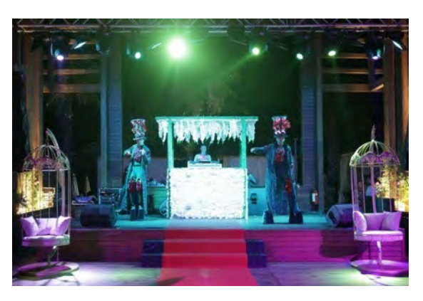
Rixos Premium Belek is a great place to relax with friends and family. Fans of outdoor activities will appreciate a wide range of entertainment programs, events and theme parties.