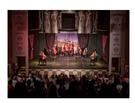
Disco Game Room Animation