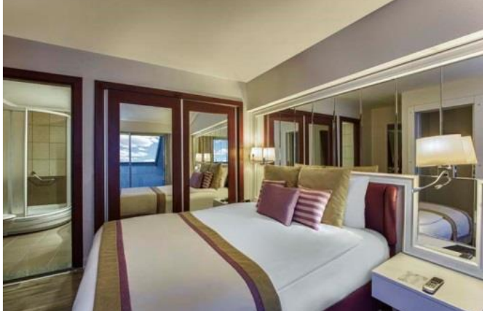
Duplex Family Room downstairs