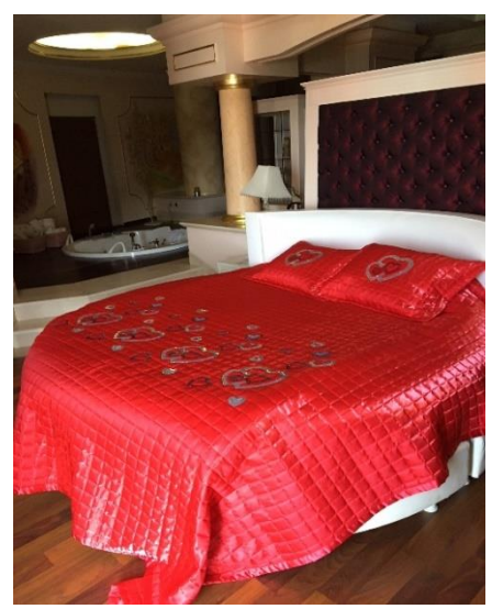
Pink Moon Suite

Pink Moon Suite (80 m²): This spacious round room is decorated in pink. It is splitted in a sleeping area with french bed, jacuzzi with sea view and WC, TV, air conditioning (central heating + between hours), a hair dryer, telephone, mini bar, safe, laminate flooring, water boiler, tea and coffee, coffee machine. Everyday: room cleaning, change of towels, once every 2 days: change of bed linen, (Accommodation: 2 adults), no balcony.