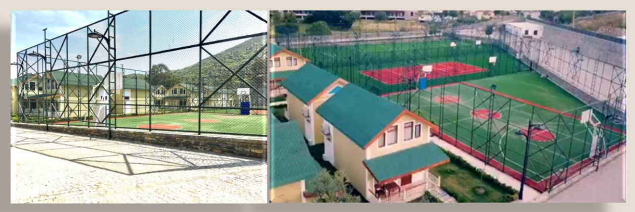
Tennis – Basketball – Mini Footboll