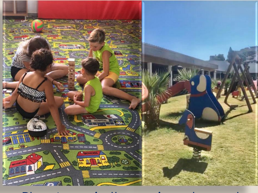
Play Areas in the main restaurant and garden