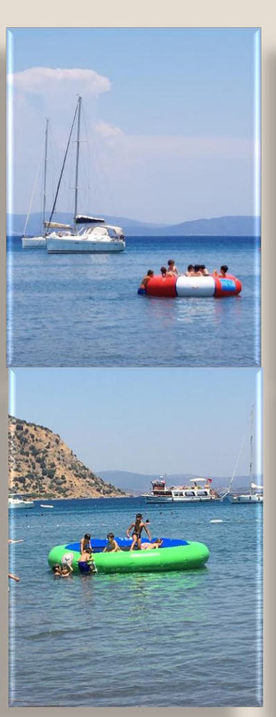
Trampoline and seesaw at sea