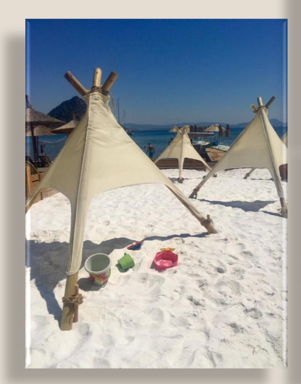
Children's white sand pool